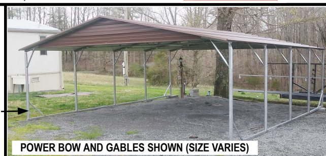
POWER BOW AND GABLES SHOWN (SIZE VARIES)

LEGS STRUTS INCLUDED ON ROOF TOP SQAURE EAVE UNITS