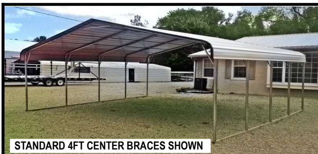
STANDARD 4FT CENTER BRACES SHOWN

STANDARD 2FT CORNER BRACES ON EVERY LEG & 4FT CENTER BRACES IN EACH UPRIGHT