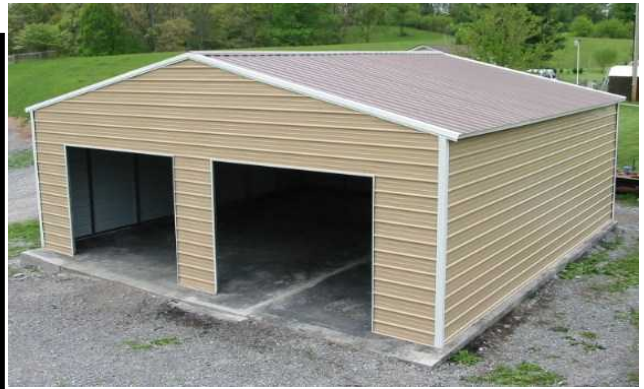
RANCH STYLE: VERTICAL ROOF AND HORIZONTAL SIDES