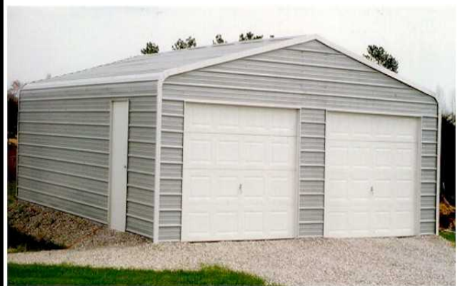
ROUND CORNER WITH HORIZONTAL ROOF & SIDING