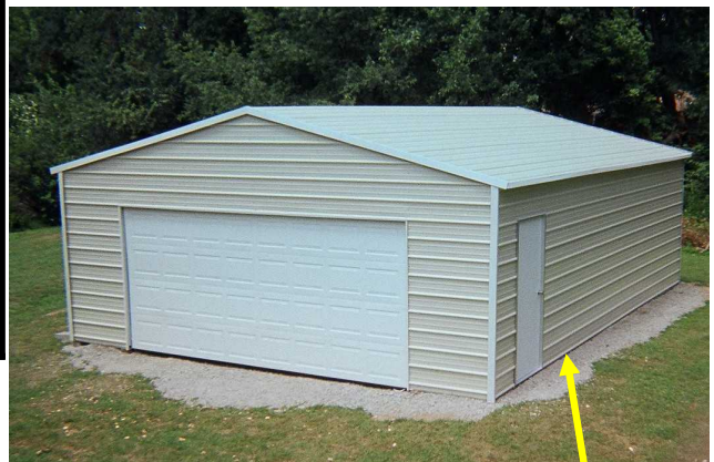
A-FRAME SQUARE CORNER WITH HORIZONTAL ROOF & SIDING